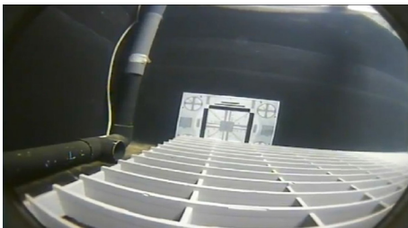
Figure 1: Sample Image

The Wide-i SeaCam does an exceptional job at giving a high quality wide angle image even in very low light conditions. This camera is capable of producing an incredible 125° (H) x 89° (V) degree field of view under water. Just like with any wide angle lens, users should be aware of vignetting effect (black corners). Figure 1 below shows a standard still image taken from the Wide-i SeaCam clearly showing the vignetting effect on the four corners of image.